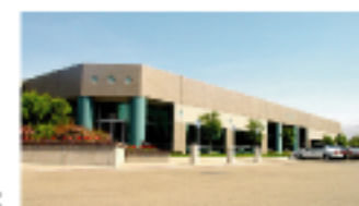
Silicon Valley Headquarters

Founded in the Silicon Valley, in 1996, ARESCOM designs, manufactures and markets a complete line of broadband internet access solutions, ranging from the most sophisticated turnkey hotel broadband access platforms for the booming worldwide hospitality market to the most simple DSL bridge/modem CPE solutions for the home and small business user. All ARESCOM DSL broadband access solutions include easy-to-use GUI-based remote management software packages for simplified setup and extensive network management capabilities. Currently, ARESCOM's DSL broadband access equipment is being widely deployed by major telecommunication carriers, ISPs, and SOHOs throughout the world.